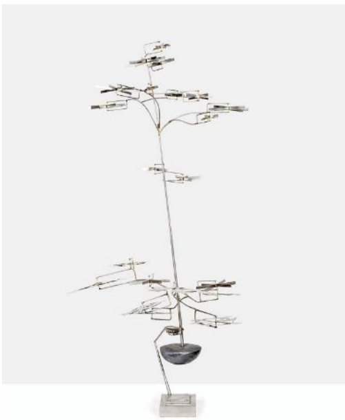
George Rickey, Wild Carrot II , 1987, stainless steel and lead, unique, 31 1/2 x 15 1/2 x 15 1/2 in, courtesy of Marlborough Gallery Inc. and the Estate of George Rickey

addresses first-hand many of the vital art issues of Rickey's time, most of which have carried forward to the present.