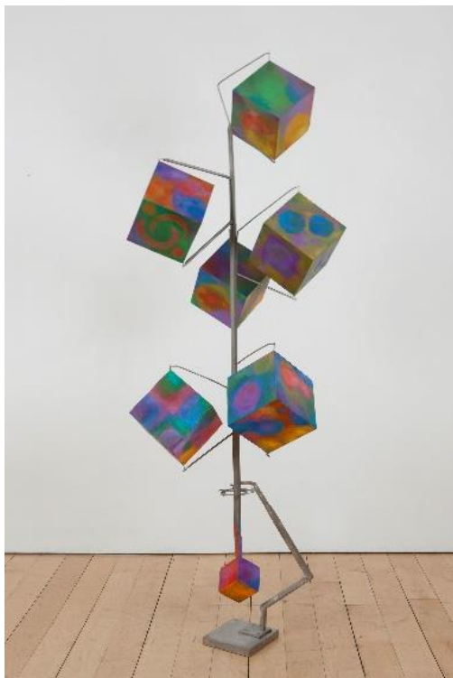
George Rickey, Column of Six Cubes with Gimbal , 1995-1996, stainless steel, polychrome, unique 83 x 32 x 32 in. Each cube: 8 x 8 in, courtesy of Marlborough Gallery Inc. and the Estate of George Rickey

OPENING RECEPTION: Thursday 20 April, 6 - 8 PM